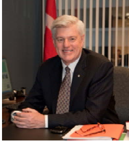
The Honourable John Manley, P.C., O.C. President and Chief Executive Officer Canadian Council of Chief Executives

The Honourable John Manley was appointed President and Chief Executive Officer of the Canadian Council of Chief Executives (CCCE) effective January 1, 2010. Mr. Manley is a former Deputy Prime Minister of Canada. From 1993 to 2003 he was a Minister in the governments of Jean Chrétien, serving in the portfolios of Industry, Foreign Affairs and Finance. From 2004 to 2009 he served as Counsel to McCarthy Tétrault LLP, a leading Canadian law firm. In 2005, he co-chaired the Independent Task Force on the Future of North America for the Council on Foreign Relations, a non-partisan think tank based in New York City. In 2007, Prime Minister Stephen Harper named Mr. Manley to chair an Independent Panel on Canada's Future Role in Afghanistan. He serves on the boards of several publicly traded companies and is active in the not-for-profit sector.