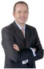
Andrew Witty Chief Executive Officer GlaxoSmithKline

Stephen Green joined The Hongkong and Shanghai Banking Corporation Limited in 1982, became Group Treasurer of HSBC Holdings plc in 1992 and was appointed to the Board of HSBC Holdings plc in 1998 as an Executive Director. He became Group Chief Executive in 2003 and Group Chairman in 2006. In addition, he is Chairman of the British Bankers' Association, Deputy President of the Confederation of British Industry (CBI), a trustee of The British Museum, and an honorary trustee of Peking University. He is also a non-executive director of BASF SE.