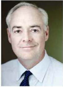
The Honourable Perrin Beatty, P.C. President and Chief Executive Officer Canadian Chamber of Commerce

The Honourable Perrin Beatty is President and Chief Executive Officer of the 170,000-member Canadian Chamber of Commerce. In that capacity, he is the principal spokesperson advocating the policy positions of the Chamber's members to the federal government, international organizations, the media and the general public. Previously, he was President and Chief Executive Officer of Canadian Manufacturers & Exporters (CME). Mr. Beatty served 21 years in the House of Commons and held seven Cabinet portfolios, including National Revenue, Solicitor General, National Defence, Health and Welfare, and Communications. From 1995 to 1999 he was President and Chief Executive Officer of the Canadian Broadcasting Corporation.