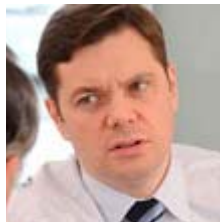
Alexey Mordashov Chairman and Chief Executive Officer Severstal

Andrey Kostin is President and Chairman of the Management Board of VTB Bank, as well as a Member of the VTB Bank Supervisory Council. He is also a Director of OJSC NK Rosneft, OJSC Russian Railways, OJSC Sovcomflot, and OJSC United Aircraft Corporation. Mr. Kostin joined VTB as Chairman in 2002. From 1979 to 1992 he served in various positions in the Ministry of Foreign Affairs. From 1993 to 1995 he was Deputy Head of the Foreign Investment Department at Imperial Bank. From 1995 to 1996 he was First Deputy Chairman of the National Reserve Bank. In 1996, he was appointed Chairman of Vnesheconombank, the state-owned development bank. In 1999 he was awarded the Order of Merit for his outstanding contribution to the development of the banking system of the Russian Federation. In 2006, Mr. Kostin was awarded the Order “For Service to the Fatherland, Level IV”.