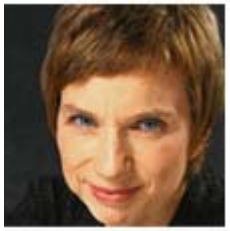
Laurence Parisot President Mouvement des Entreprises de France (MEDEF)

Laurence Parisot has been President of the Mouvement des Entreprises de France (MEDEF), the largest association of employers in France, since 2005. She studied Law at Université Nancy-II and then entered the Institut d'Études Politiques de Paris. In 1986, she became a director of the Louis Harris Institute polling firm. In 1990, she purchased the Paris-based Institut français d'opinion publique (IFOP), an international marketing firm, and has been its President ever since. She has been a member of the Board of Directors of Banque BNP Paribas since 1990. She is a recipient of France's Ordre national du Mérite.