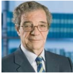
Cesar Alierta Executive Chairman and Chief Executive Officer Telefónica

Cesar Alierta has been Executive Chairman and Chief Executive Officer of Telefónica since July 2000, and is a member of the Boards of Directors of China Unicom and Telecom Italia. Between 1970 and 1985, he was General Manager of the Capital Markets division at Banco Urquijo in Madrid. Subsequently, he was Chairman and founder of Beta Capital. Between 1996 and 2000, he held the post of Chairman of Tabacalera, S.A., and subsequently Altadis following the company's merger with the French group Seita. He joined the Board of Directors of Telefónica in 1997. In September 2005, Mr. Alierta was honoured as “The Global Spanish Entrepreneur” by the Spanish/U.S. Chamber of Commerce. This prize was awarded in recognition of the Telefónica Group's success in being named to the Dow Jones Global Titans 50 index, a list of the largest and best-known blue-chip companies traded on the New York Stock Exchange.