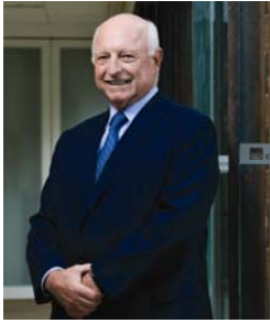
Jorge Gerdau Johannpeter Chairman of the Board of Directors Gerdau Group