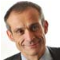
Jean-Pascal Tricoire President and Chief Executive Officer Schneider Electric

Laurence Parisot has been President of the Mouvement des Entreprises de France (MEDEF), the largest association of employers in France, since 2005. She studied Law at Université Nancy-II and then entered the Institut d'Études Politiques de Paris. In 1986, she became a director of the Louis Harris Institute polling firm. In 1990, she purchased the Paris-based Institut français d'opinion publique (IFOP), an international marketing firm, and has been its President ever since. She has been a member of the Board of Directors of Banque BNP Paribas since 1990. She is a recipient of France's Ordre national du Mérite.