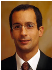
Marcelo Bahia Odebrecht President Odebrecht Group