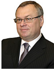
Andrey L. Kostin President and Chairman of the Management Board VTB Bank

Andrey Kostin is President and Chairman of the Management Board of VTB Bank, as well as a Member of the VTB Bank Supervisory Council. He is also a Director of OJSC NK Rosneft, OJSC Russian Railways, OJSC Sovcomflot, and OJSC United Aircraft Corporation. Mr. Kostin joined VTB as Chairman in 2002. From 1979 to 1992 he served in various positions in the Ministry of Foreign Affairs. From 1993 to 1995 he was Deputy Head of the Foreign Investment Department at Imperial Bank. From 1995 to 1996 he was First Deputy Chairman of the National Reserve Bank. In 1996, he was appointed Chairman of Vnesheconombank, the state-owned development bank. In 1999 he was awarded the Order of Merit for his outstanding contribution to the development of the banking system of the Russian Federation. In 2006, Mr. Kostin was awarded the Order “For Service to the Fatherland, Level IV”.